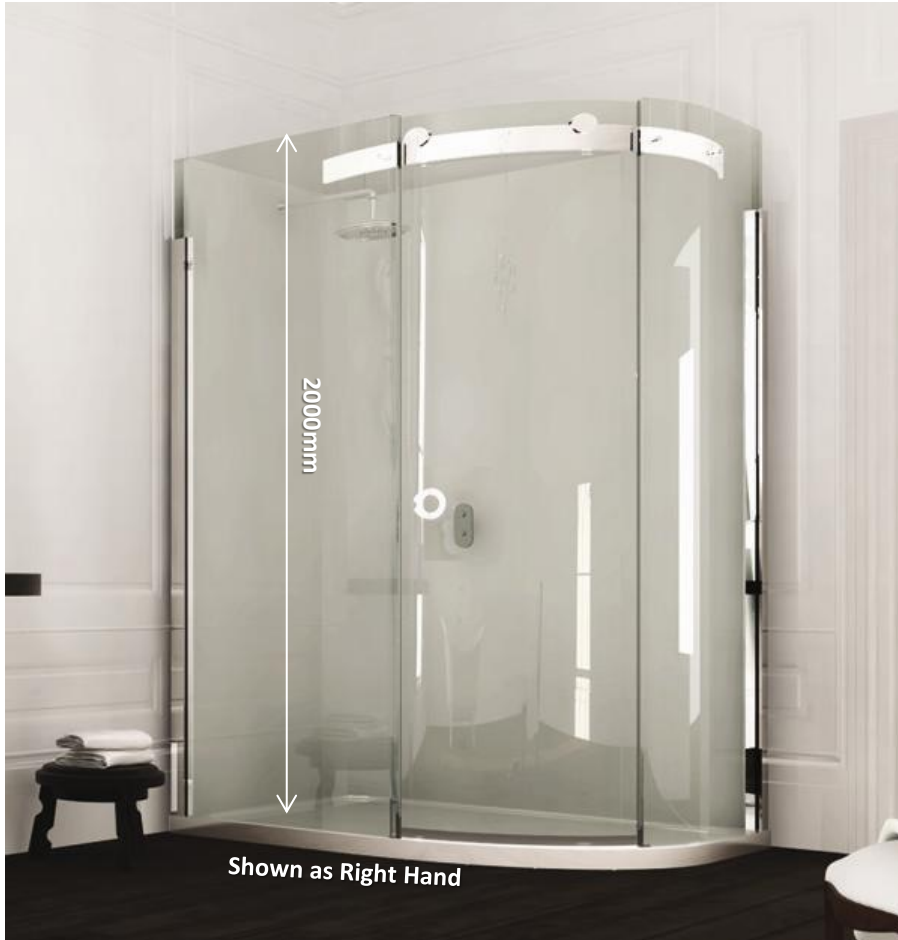
Shown as Right Hand